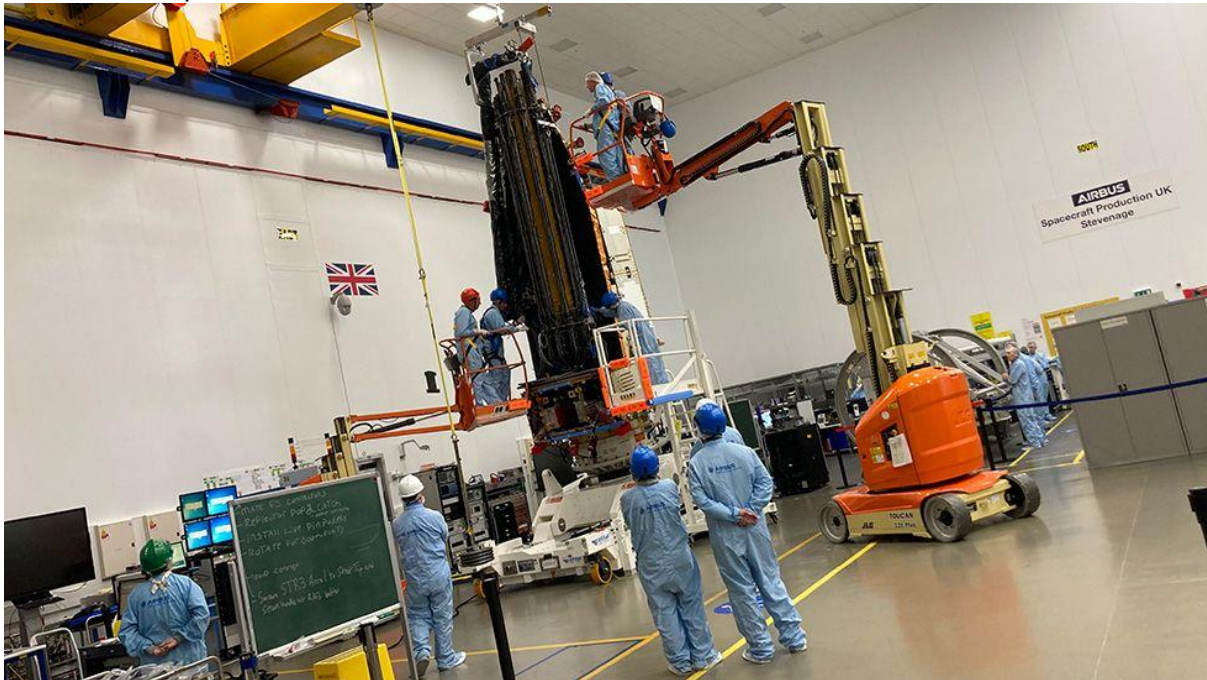
Engineers conduct the "pop and catch" test, to ensure the antenna mechanism will be released safely in orbit

It's a key component on the European Space Agency's Biomass mission , now under construction in the UK at aerospace manufacturer Airbus.